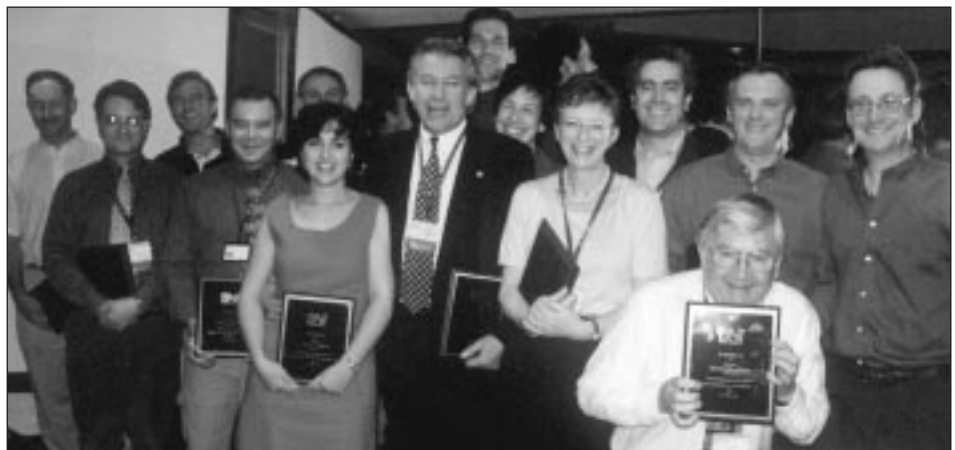
REWARDING JOURNEY: Some of BNI's European directors in Long Beach.

What is it that makes 22 busy UK directors pack their bags, pay their own airfares and jet half way around the world to join 150 similar people for three days of discussion?