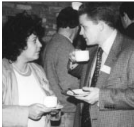
FORGING LINKS: Cross-chapter networking in South London

“At our recent combined breakfast in Wandsworth, one member whose video production business had tended not to attract many referrals from her own colleagues, came away with four pieces of prospective business